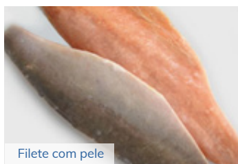
Filete com pele